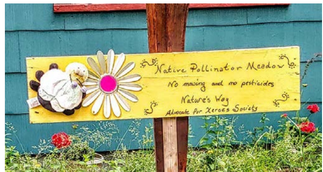
Above: Signs can go a long way toward acceptance of an “untidy” yard.

Below: Weeding can be a relaxing activity, giving you time to de-stress from daily life and the chance to carefully observe and appreciate the diversity of wildlife your garden supports.