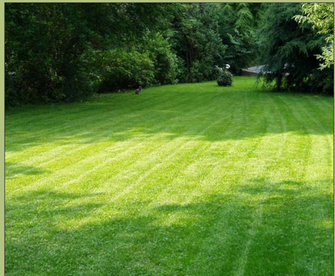
Although white Dutch clover is most obvious, the bee-friendly lawn on left has eight flowers that bloom through the spring and summer. In contrast, the lawn on the right offers little to support pollinators.