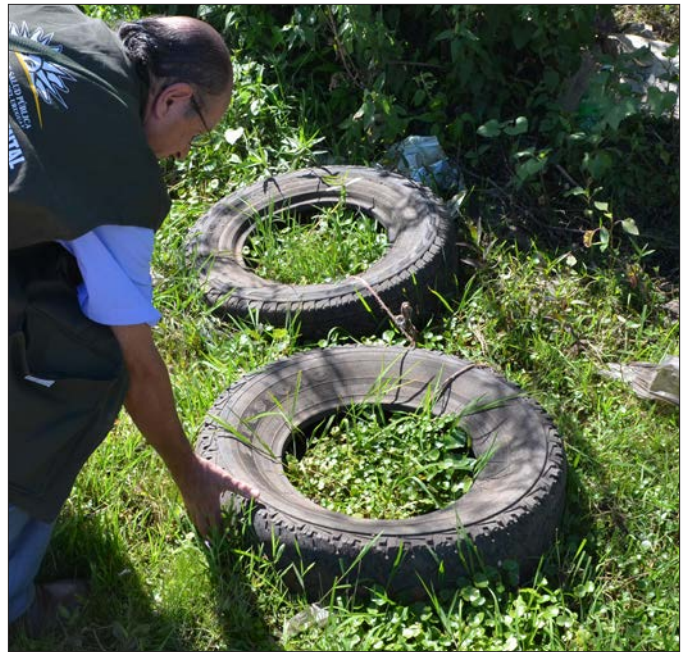
The most effective way to reduce the number of mosquitoes is to remove potential breeding places. Any object in which water can puddle, including old tires, buckets, and flower pots, may be used by mosquitoes. Dump water from these places at least once a week.

As pollinators move through the landscape they encounter many hazards, including disease, pesticides, and lack of forage and nesting sites. By creating a pollinator garden, you are providing them a safe oasis. Pollinator-friendly yards also inspire curiosity and foster awareness. Once your neighbors see yours, they might decide to add a few pollinator plants in their yard. In some communities, neighbors have combined their efforts to purposefully expand habitats to create corridors that help expand the range of these beneficial species. In this digital age, you can even inspire people far away by sharing your garden through the Xerces Society's Bring Back the Pollinators campaign, a forum celebrating pollinator gardens across the country. And, of course, be sure to take a few moments every day to marvel at the diversity of insects right under your nose.