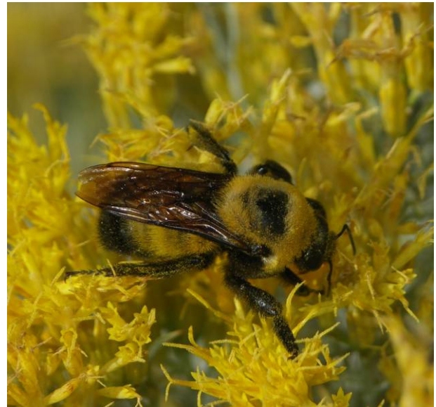
Right – bumble bee on rabbit brush (Vaughan)

The purpose of this technical note is to provide information about establishing, maintaining and enhancing habitat and food resources for native pollinators, particularly for native bees, in Riparian buffers, Windbreaks, Hedgerows, Alley cropping, Field borders, Filter strips, Waterways, Range plantings and other NRCS practices. We welcome your comments for improving any of the content of this publication for future editions. Please contact us!