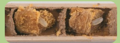
Egg chamber: mud wall, pollen ball, egg, mud wall...