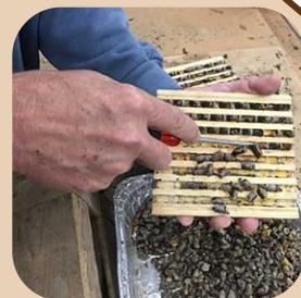
Harvest cocoons from tunnels.