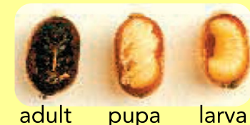
adult pupa larva

The pupa develops into an adult by fall.