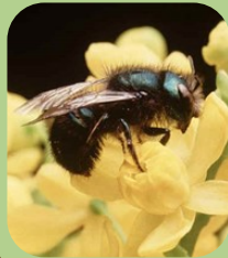
Foraging mason bee