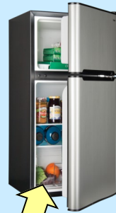
Store in crisper.