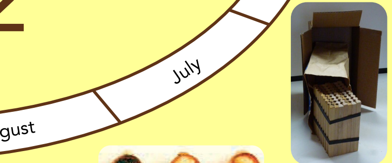
Enclose nest block in bag and box.