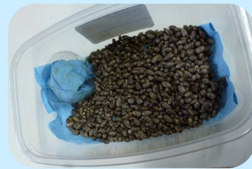
Cocoons in ventilated container with moist paper towel in a cup.

Bees: The mason bees hibernate until the spring.