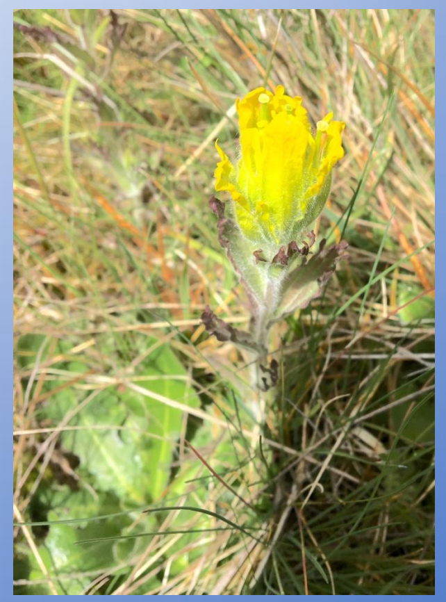
Yellow paintbrush, Native Oaks Ridge

Protect at least 16,880 acres of wildlife habitat by 2025, including a diverse assemblage of habitats distributed throughout the Willamette Basin; focusing on Conservation Opportunity Areas and Strategy Habitats in support of the Oregon Conservation Strategy; and supporting Strategy Species and ESA-listed species.