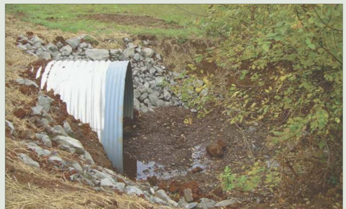
Blair Creek culvert after replacement.

Our volunteers are a mainstay of this program with