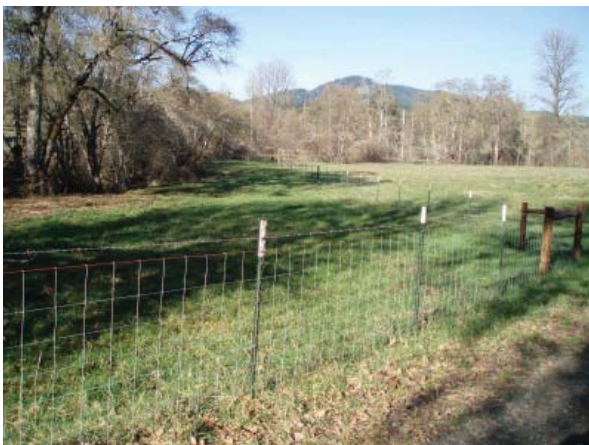
The Federal Farm Bill CREP Program funded fencing to keep OSU livestock out of Oak Creek. Livestock in your creek? Give us a call! 541-753-7208