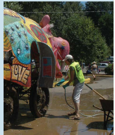
Who washes a kinetic race hippo? daVinci Days volunteers!

In a month or two you'll be able to access weblinks for hundreds of environmental resources via the Benton County website.