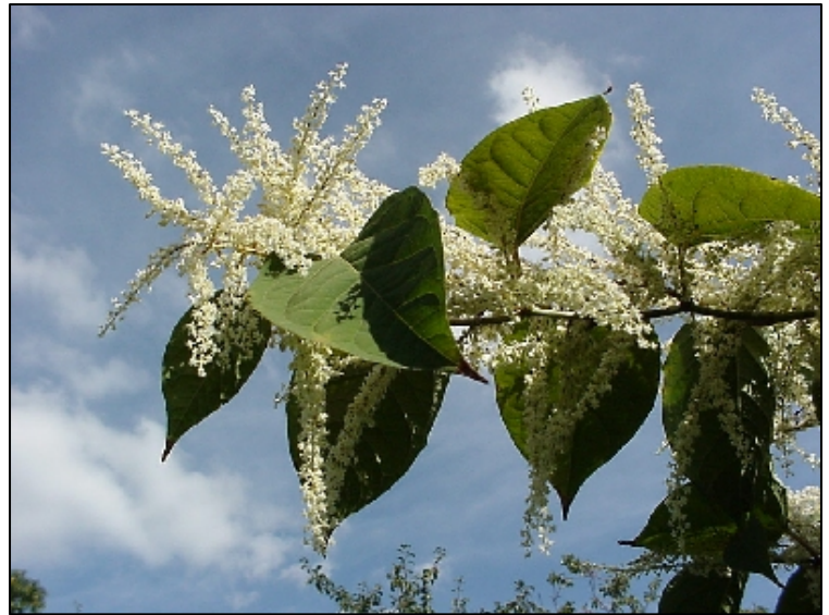
Japanese knotweed is extremely aggressive and forms dense monocultures that displace native plant habitat.

The Luckiamute River has been identified as a high priority for control of Japanese Knotweed by the Northwest Oregon Invasive Weed Management Partnership. It spreads readily by seed and can also sprout from small pieces of branch or root. If tackled immediately, this threat can be removed before it gets out of control. Because knotweed spreads so easily and quickly, finding and removing ALL of it along the Luckiamute River is essential. We have contacted all landowners who own property adjacent to the Luckiamute River, but not all of them have responded.