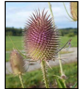
Common teasel ( Dipsacus fullonum )