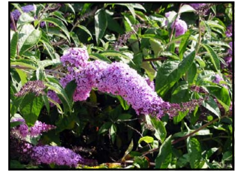
Butterfly bush ( Buddleja davidii )

The creation of this brochure was made possible by the support of the Oregon Department of Agriculture, Benton County, and Benton Soil and Water Conservation District.