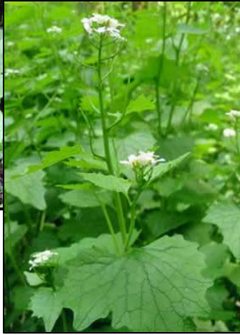
Second year—flowering stage