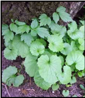
First year—rosette stage