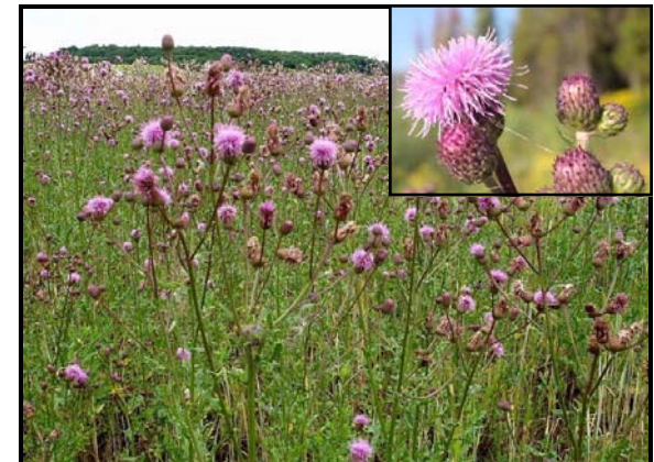
Canada thistle ( Cirsium arvense )